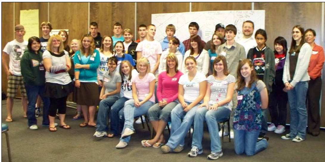
Thirty-three students from seven school districts gathered to discuss the strengths and areas of concern in their communities and to plan ways to strengthen the environment for themselves and their peers.